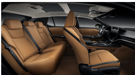
Hazel | 40