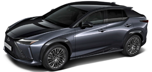
Classic Black / Sonic Shade | 2YH