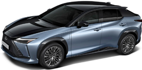
Classic Black / Ether Metallic | 2YG