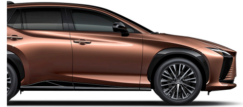
Sonic Copper | 4Y5