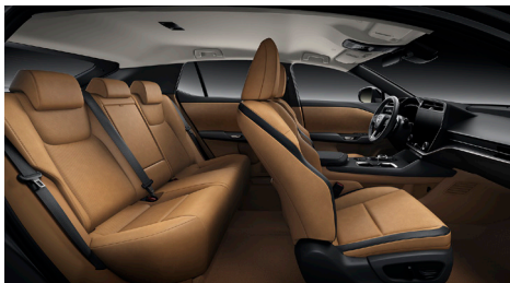
Hazel | 40