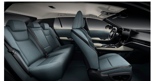
Orange | 80