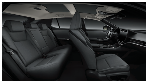
Greyscale | 10