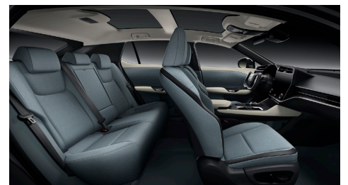
Orange | 80

THE IMAGES AND CONTENT IN THIS BROCHURE HAVE BEEN SOURCED GLOBALLY AND MAY DIFFER FROM NEW ZEALAND SPECIFICATION.