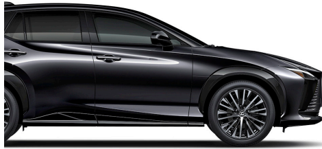
Graphite Black | 223