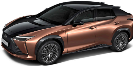
Classic Black / Sonic Copper | 2YF