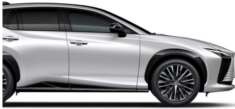
Sonic Quartz | 085