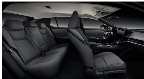
Greyscale | 10