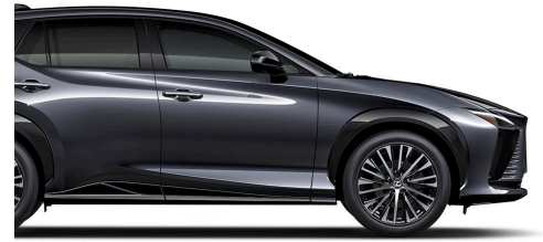
Sonic Shade | 1L1