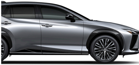
Sonic Iridium | 1L2