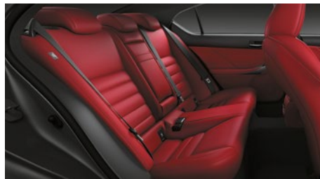
Flare Red 70 | Satin Chrome | 300 & 300h F Sport Flare Red 74 | Silver Woodgrain | 350 F Sport