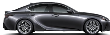
Sonic Shade | 1L1