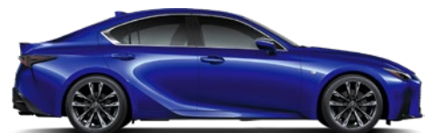
Cobalt | 8X1 | F Sport only