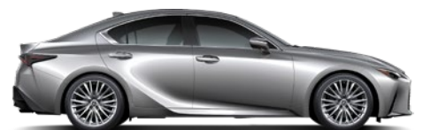
Sonic Iridium | 1L2