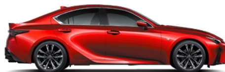
Infrared | 3T5 | F Sport only