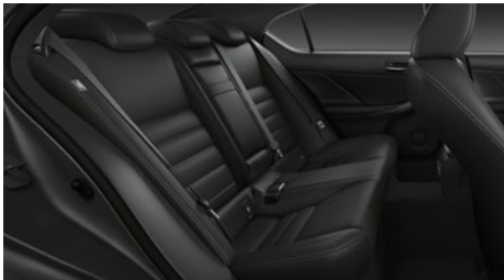
Black 23 | Black Ink Woodgrain | 300 & 300h