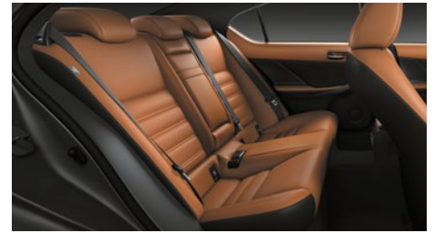
Ochre 41 | Black Metallic | 300 & 300h