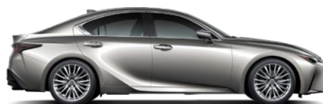
Titanium | 1J7