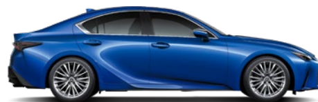
Celestial Blue | 8Y6 | n/a F Sport

IMAGES AND CONTENT IN THIS BROCHURE HAVE BEEN SOURCED GLOBALLY AND MAY DIFFER FROM NEW ZEALAND SPECIFICATION.