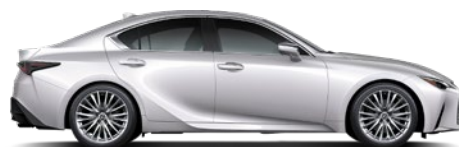
Sonic Quartz | 085 | n/a F Sport