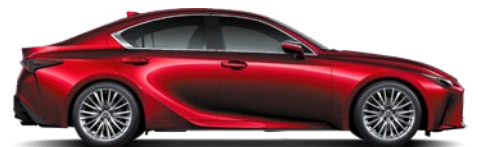
Burgundy | 3R1 | n/a F Sport