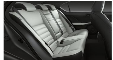
White 00 | Satin Chrome | 300 & 300h F Sport