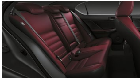
Dark Rose 33 | Black Ink Woodgrain | 300 & 300h